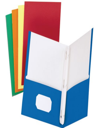
1 Pocket Folder