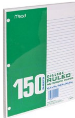
College Ruled Paper