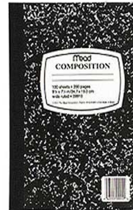
1 Composition Books